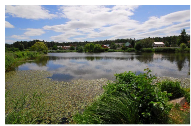
Figure 1 Fishing lake near the village Moshchun.