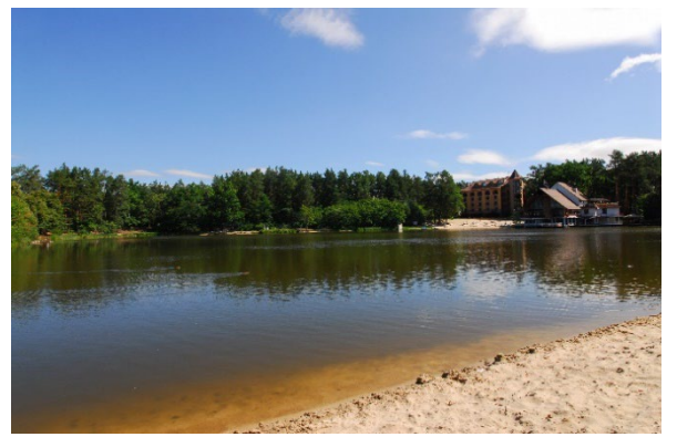
Figure 2 Recreational lake near the village Moshchun.